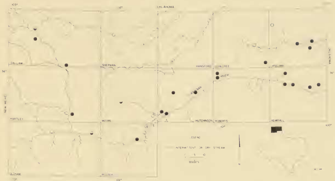
FIG. 15.—Distribution of two species of pocket gophers in northern Texas Panhandle. Solid symbols represent Geomys bursarius , open symbols represent Cratogeomys castanops , half-solid symbols indicate localities where both species have been taken.

Specimens examined (13).—HANSFORD CO.: 3 mi. S, 6 mi. W Gruver, 6 (3 KU); 10 mi. S, 3 mi. W Gruver, 3. HEMPHILL CO.: 3 mi. E Canadian, 2; Lake Marvin, 1.5 mi. N, 13 mi. E Canadian, 1. HUTCHINSON CO.: 9 mi. E Stinnett, 1 (UT).